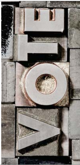
© Central European University, 2010