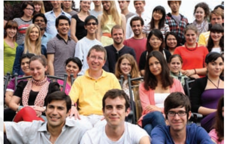
Have a good time at the Sommerhochschule

Students from all over the world have been drawn to the program, not only because of the outstanding academic reputation of its European Studies courses and the excellent opportunities it offers students to learn German, but also because of its location directly on the shores of one of Austria's most scenic lakes, Lake Wolfgang, in the Salzkammergut region, and because of the area's excellent sports and recreational facilities .