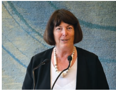
Opening Ceremony 2013